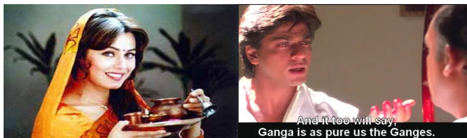
Fig. 7: Ganga as the female protagonist in Pardes and as a metaphor for purity

Ganga wears Indian jewellery, bindi , and maang tikka fostering the Indian cultural identity abroad. The attire signifies the strength of Indian culture among the diaspora where, despite being on a foreign land, the traditions and customs prevail.