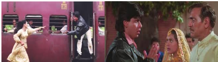
Fig. 1: Scenes from the movie DDLJ

Figure 2 shows the dialogue between a father and a daughter and the textual evidence, such as " Ja Simran, jee le apni zindagi " (Go, Simran , live your life), communicates the importance of individual agency and cultural pride, consequently encapsulating India's cultural sovereignty by arguing for personal happiness and harmonizing it with traditional values. This signifies the flexibility and freedom reflected in Indian traditions.