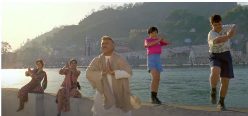
Fig. 5: Picturization of a song from Pardes