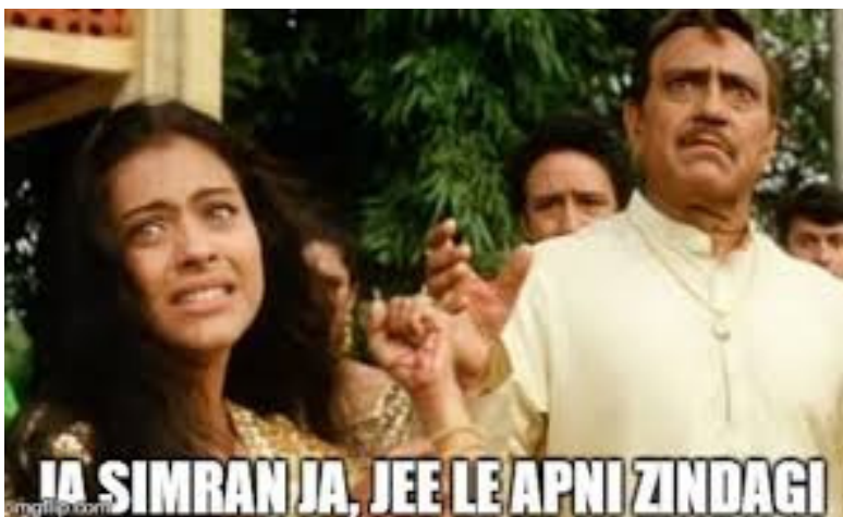
Fig. 2: An iconic scene from the movie DDLJ