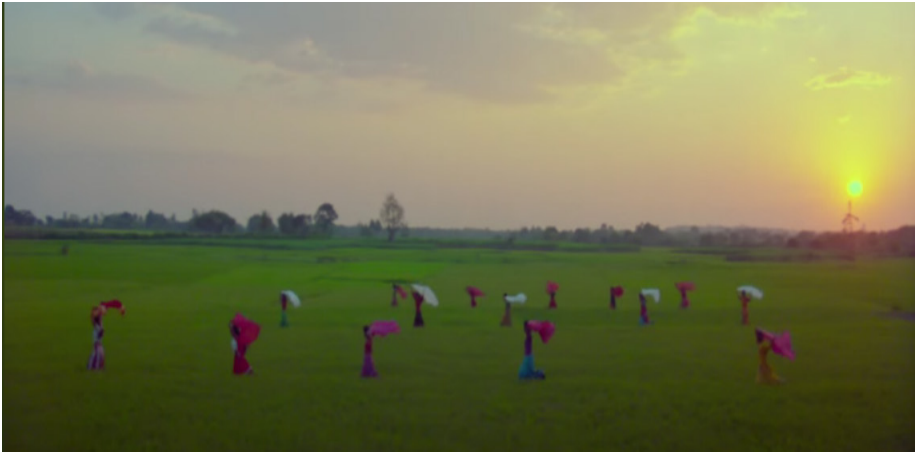
Fig. 4: Picturization of a song from DDLJ