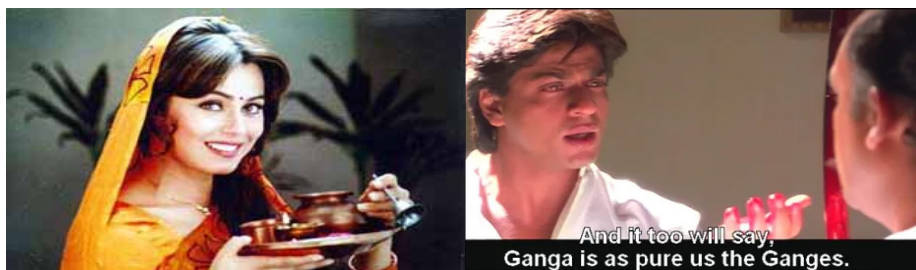
Fig. 7: Ganga as the female protagonist in Pardes and as a metaphor for purity

Ganga wears Indian jewellery, bindi , and maang tikka fostering the Indian cultural identity abroad. The attire signifies the strength of Indian culture among the diaspora where, despite being on a foreign land, the traditions and customs prevail.